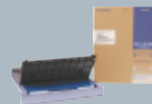
UPT-517BL Media (14 x 17") Blue Thermal Film Printing Pack Contents: 125 sheets per pack