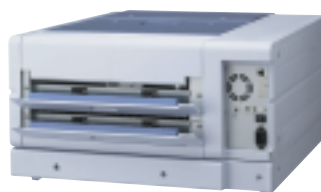
UP-DF550 Rear Panel